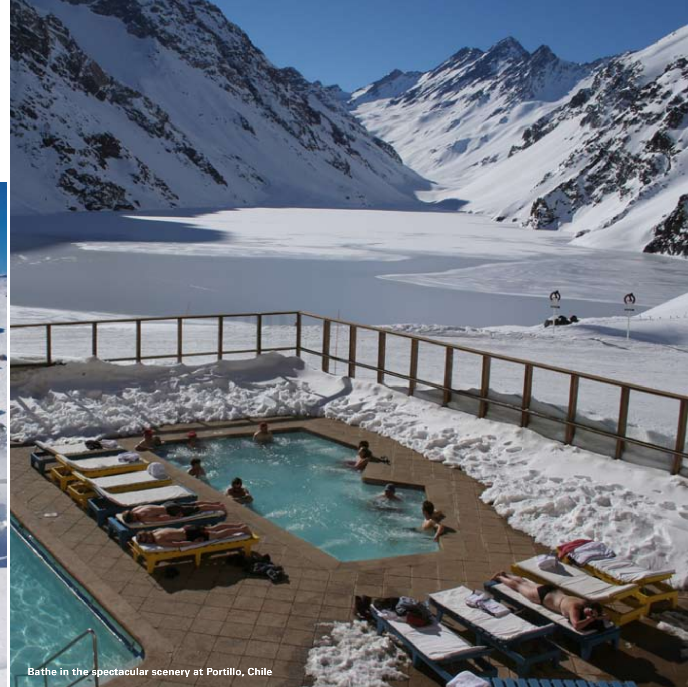
Bathe in the spectacular scenery at Portillo, Chile

Be seen at the award winning Wallpaper* favourite Huski Apartments for pre slope coffee, ski in to Oishi Go at Silver-ski for Japanese inspired cocktails at 5pm and then degus-